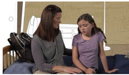
How to Respond to Sexual Abuse Disclosure