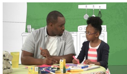
How to Talk with Kids About Sexual Abuse

Copy these video links and share these videos to help spread the word that even though child sexual abuse is scary, talking about it shouldn't be.