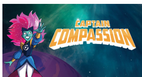
Facebook, Twitter, LinkedIn